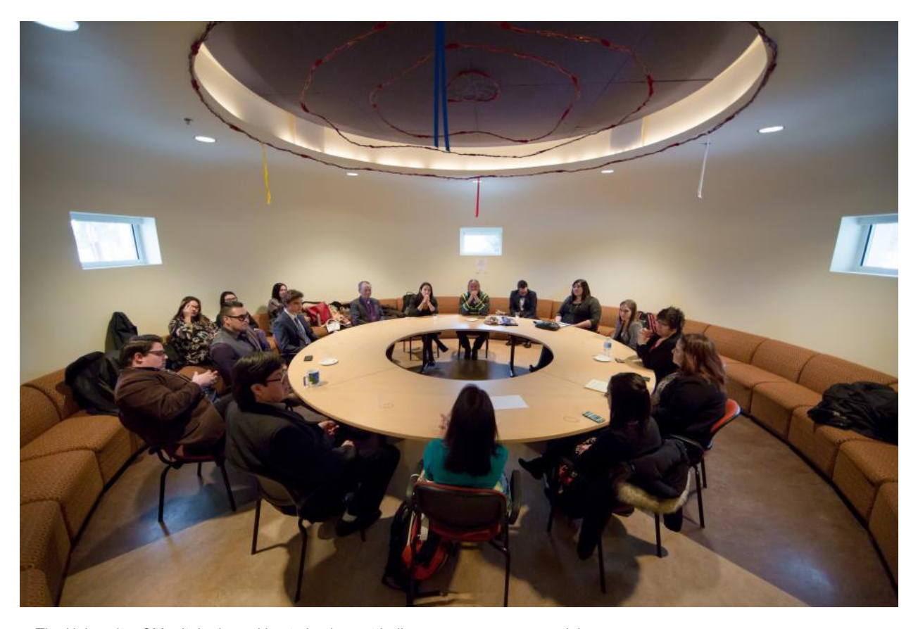
The University of Manitoba is working to implement Indigenous governance models.

The ongoing support of a university-wide Reconciliation Action Plan to implement the relevant Calls to Action of the TRC will continue. The Board of Governance and Senate Standing Committee development will be ongoing as well as ensuring Indigenous representation on relevant committees.